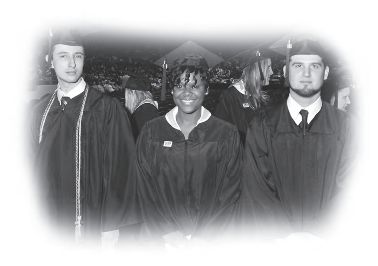
Personal help with admissions, registration, student records and scholarship services can make dreams of earning a bachelor's degree a reality.