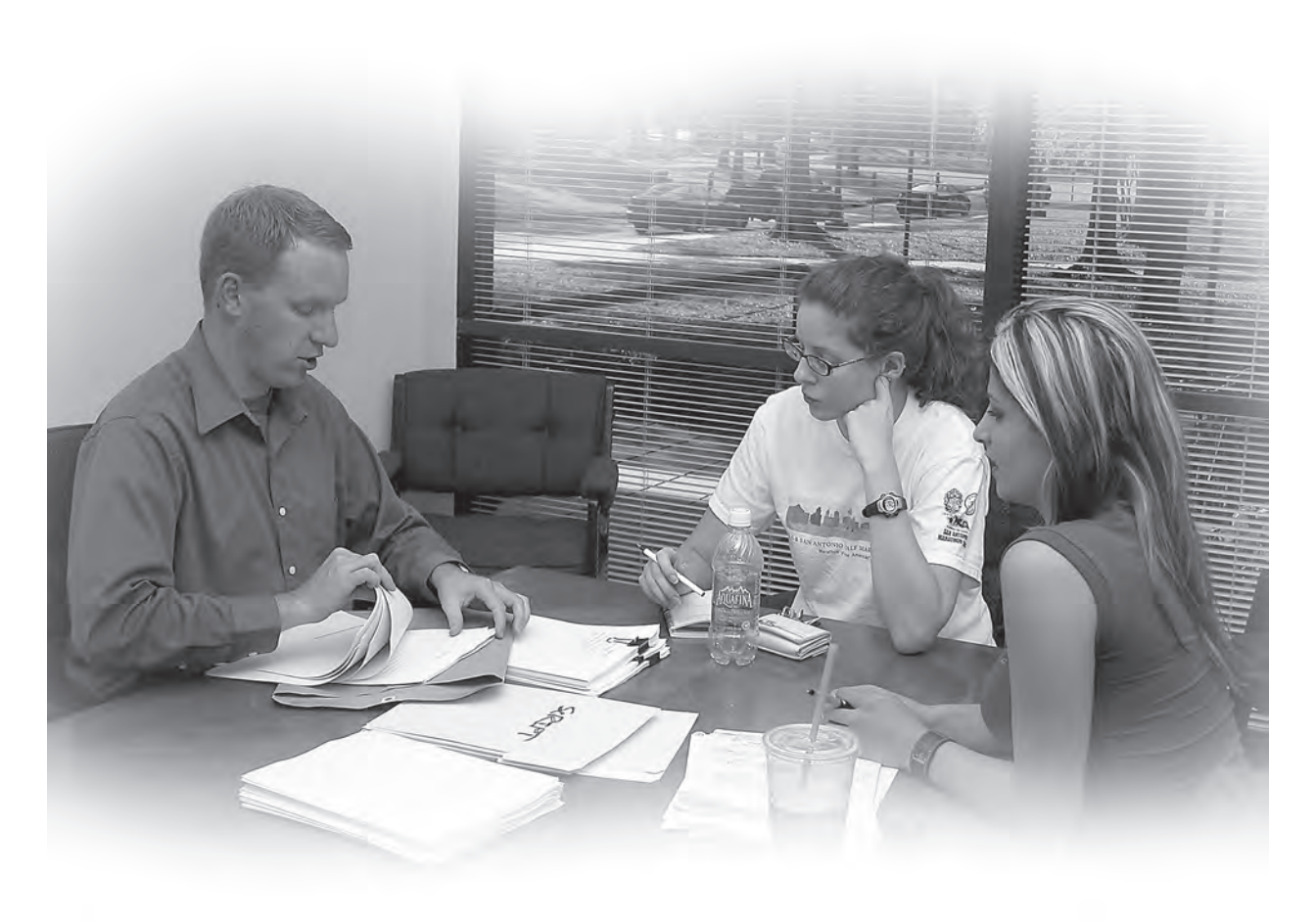
UHCL's small-class environment enables students to work closely with professors and benefit from individual attention.