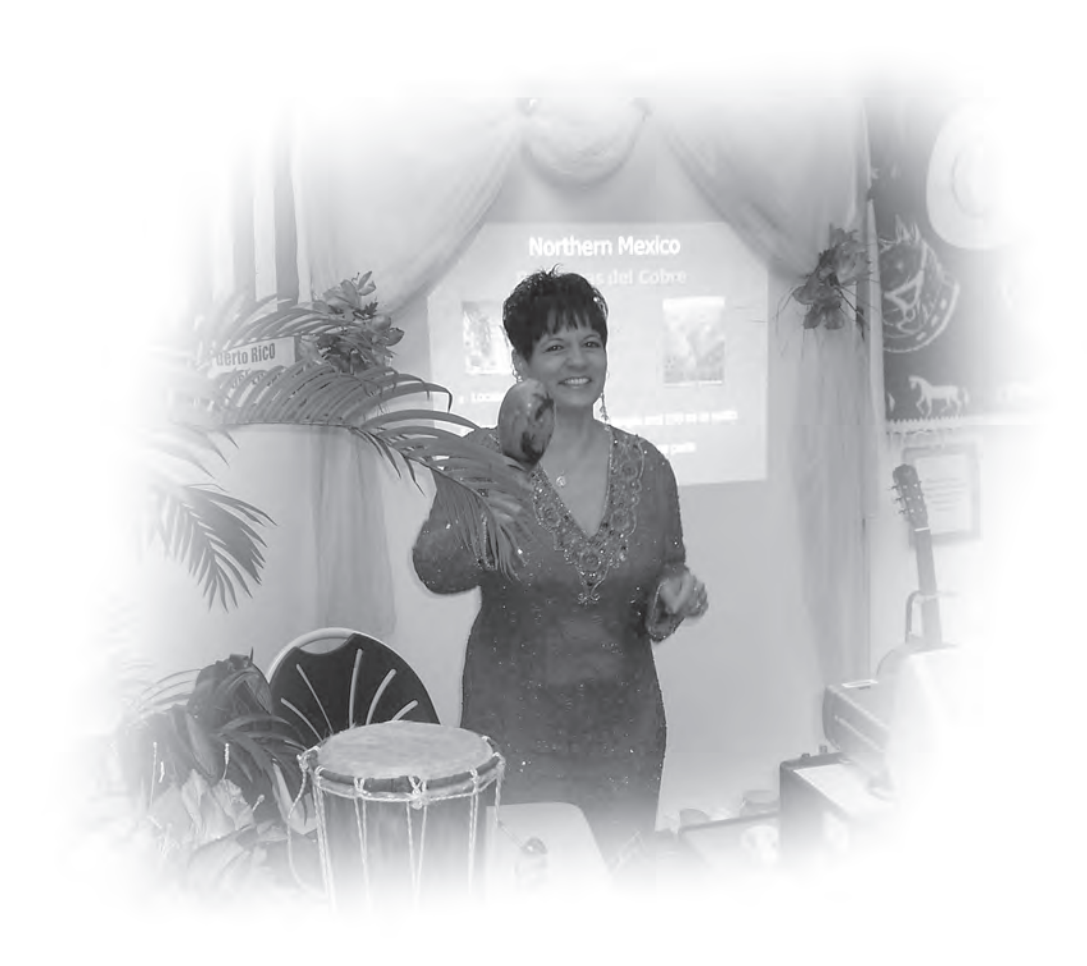
Students celebrate their countries, cultures and traditions at the university's annual Global Expo.