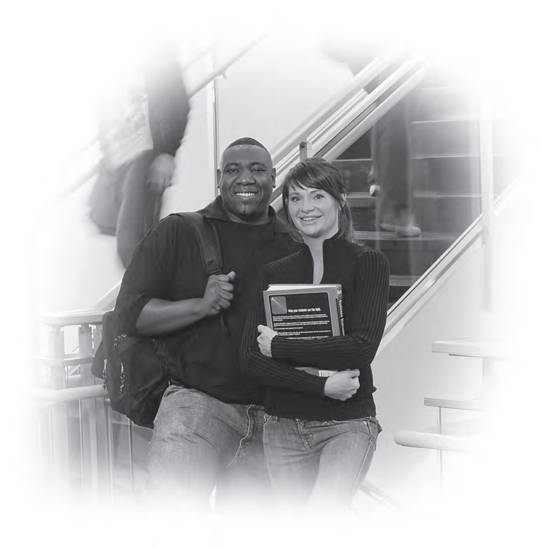
Most UHCL students are eligible for some type of financial aid, and receive their aid disbursements prior to the beginning of classes so they can pay for tuition and books.