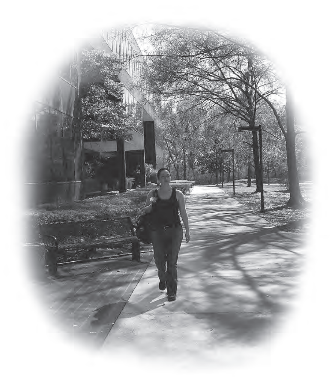
University of Houston-Clear Lake offers a quality education in a beautiful, safe environment.