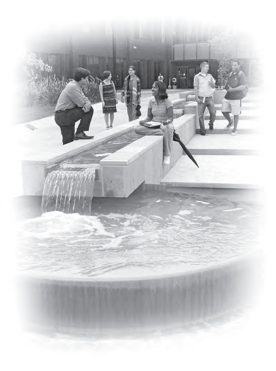
Alumni Plaza, located between the Student Services and Classroom Building and the Bayou Building, is a relaxing place to study and take a break between classes.