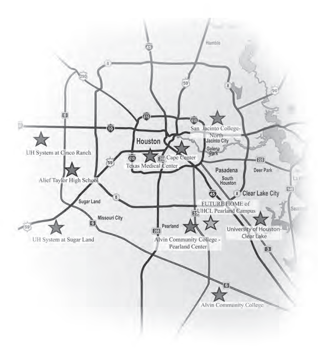
Many UHCL programs offer courses online as well as classes at strategically chosen off-site locations. For example, courses in the Master of Healthcare Administration are offered at a new UHCL facility in the Texas Medical Center.