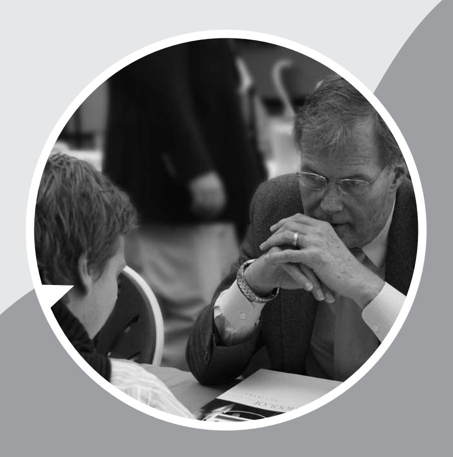
Faculty in the School of Business work with students to help them meet their academic goals.