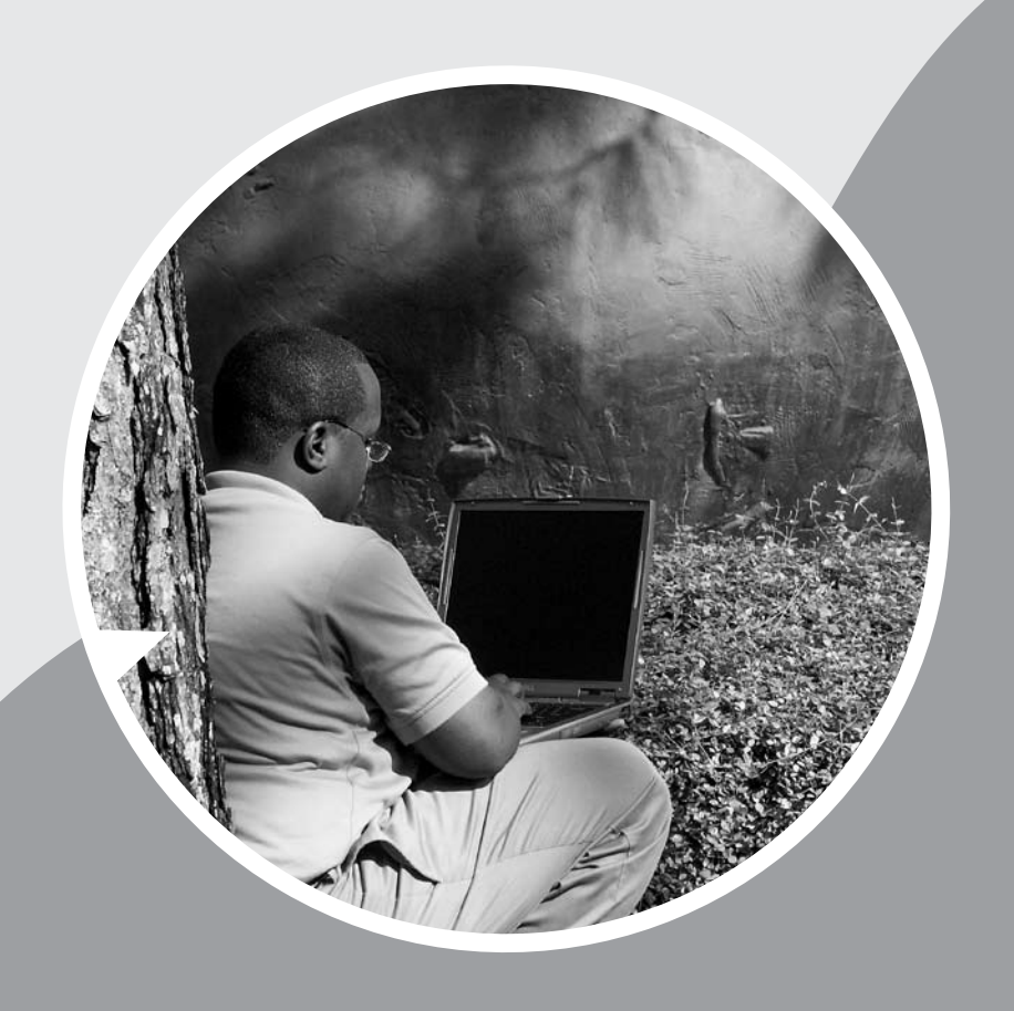
Students applying for financial aid can complete the process entirely online.