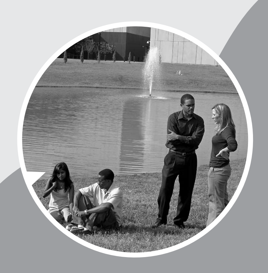
Students enjoy a relaxing time in front of the pond in front of the Student Services and Classroom Building.