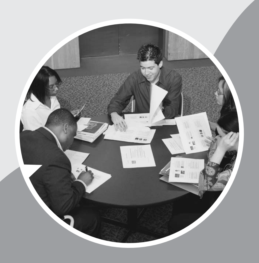
A group of business students gather in the Bayou Building to work on a group project.