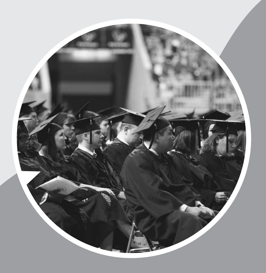
Commencement ceremonies honor the academic accomplishments of UHCL graduates.