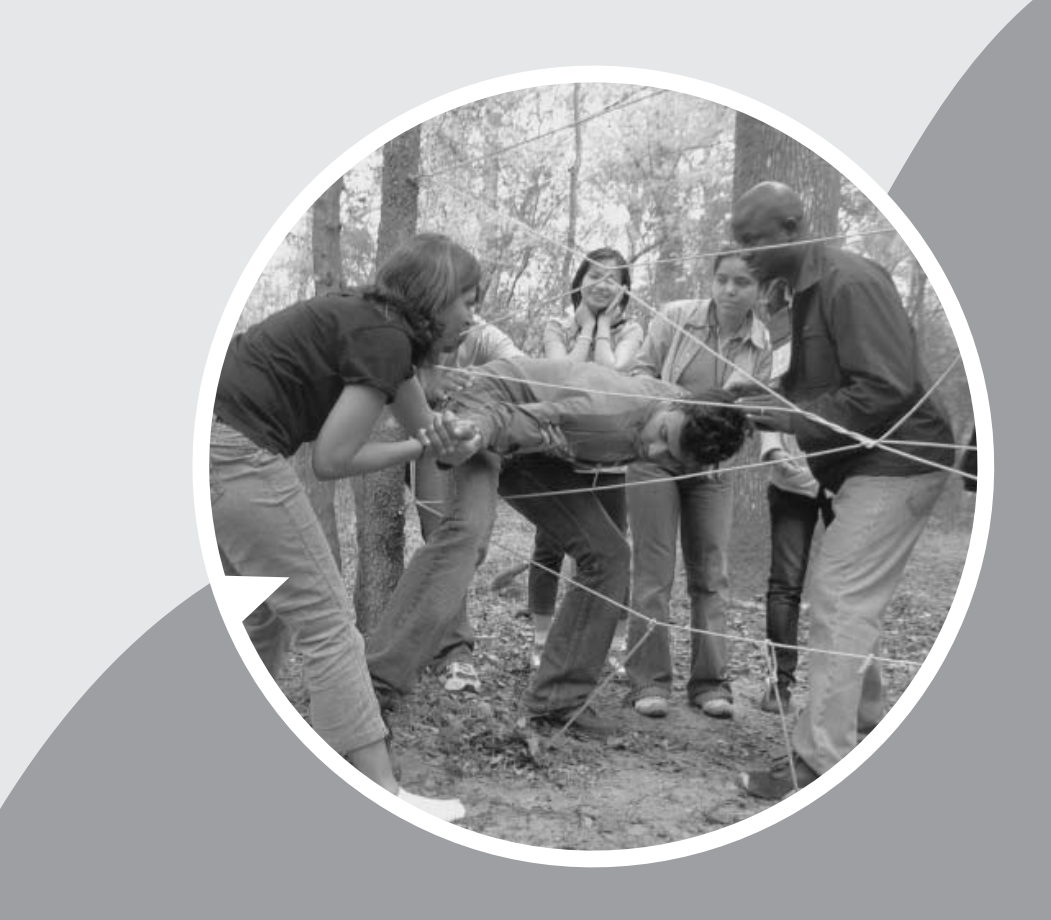
Students negotiate a low ropes course challenge at the annual Student Leadership Institute Retreat.