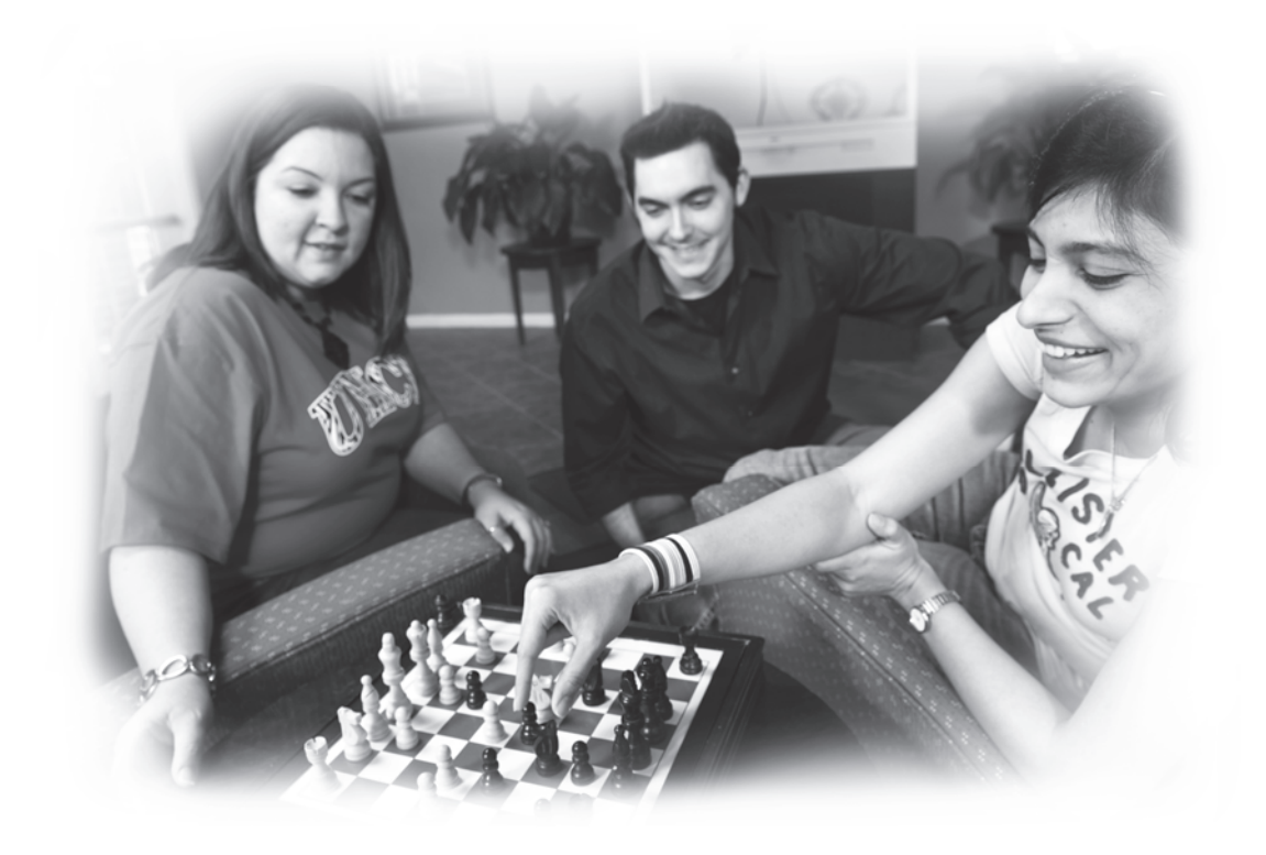
From informative admission previews and open houses to a one-stop Student Assistance Center, students find an array of resources to assist them in navigating their way toward academic success at UHCL.