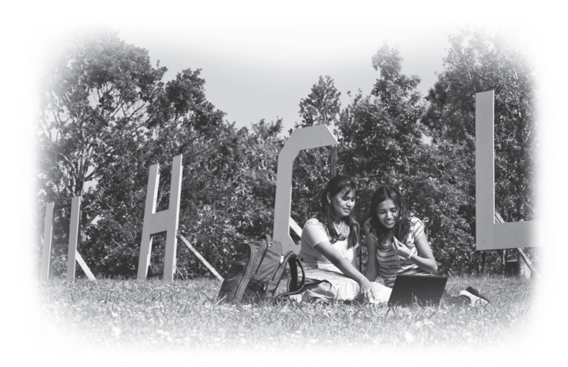
Situated on a 524-acre natural environment, UHCL's campus grounds feature picturesque park-like settings for studying or visiting with fellow students.