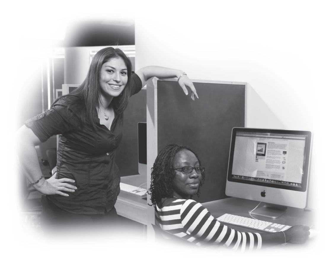
Financial aid often helps clear a path toward success for students. With many financial aid processes conveniently offered online, students regularly check their assigned UHCL email accounts to ensure they are up-to-date on important deadlines, requirements and announcements.