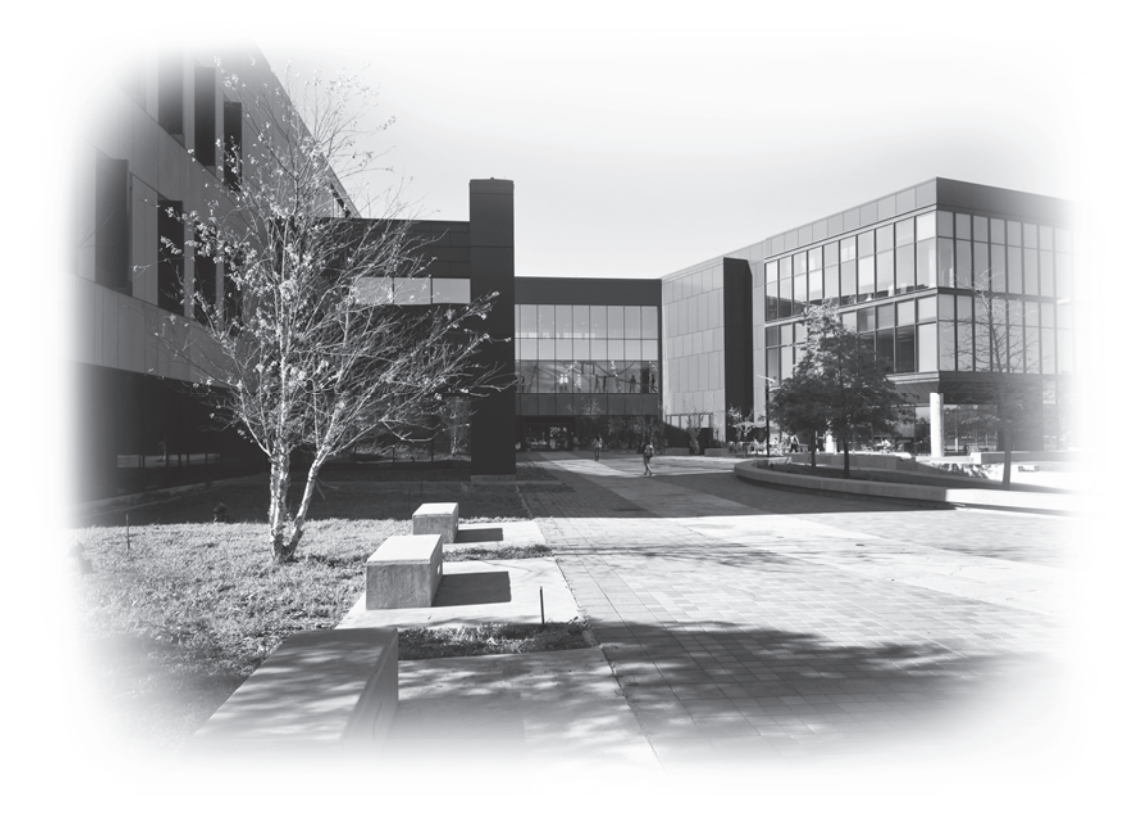
UHCL's Student Services and Classroom Building houses the Student Assistance Center and the Fitness Zone as well as state-of-the-art classroom facilities.