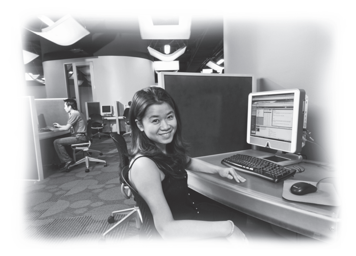
Students have access to various university computing resources, including computer labs, specialized teaching labs, on-campus wireless access and free-checkout of wifi-equipped laptops.