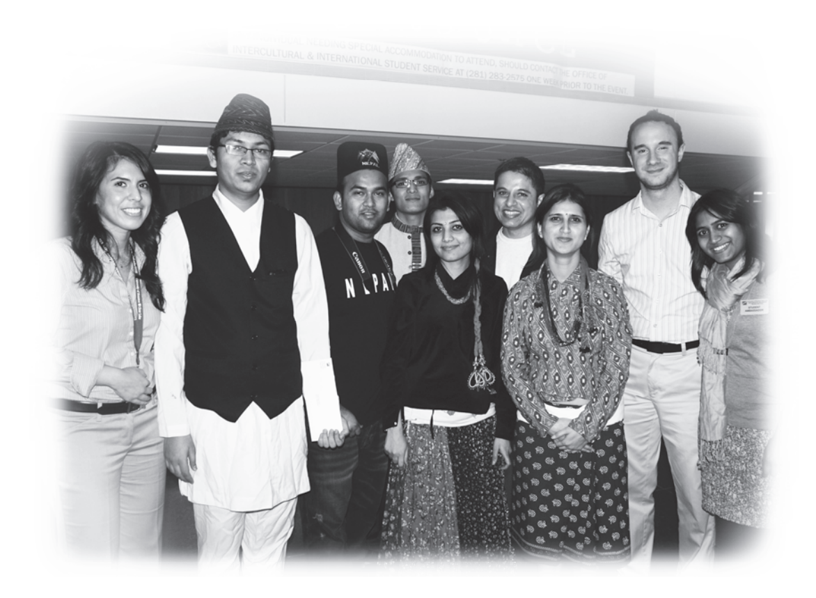
UHCL Student Services provides many opportunities for academic, professional and personal growth. Events such as the Global Expo bring together people from a diverse range of cultures.