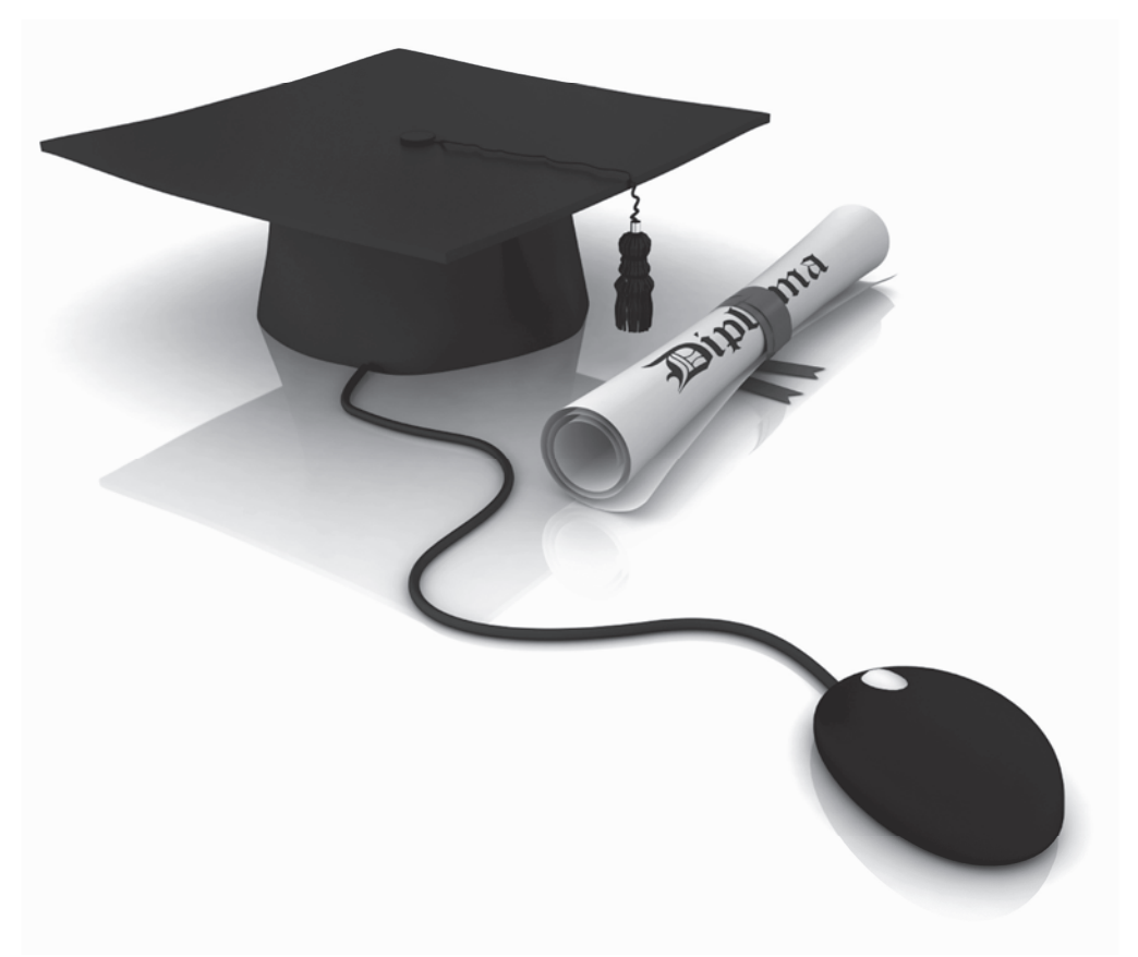
Whether on-campus, off-site, online or a combination of the three, UHCL students enjoy a variety of opportunities to complete their degrees.