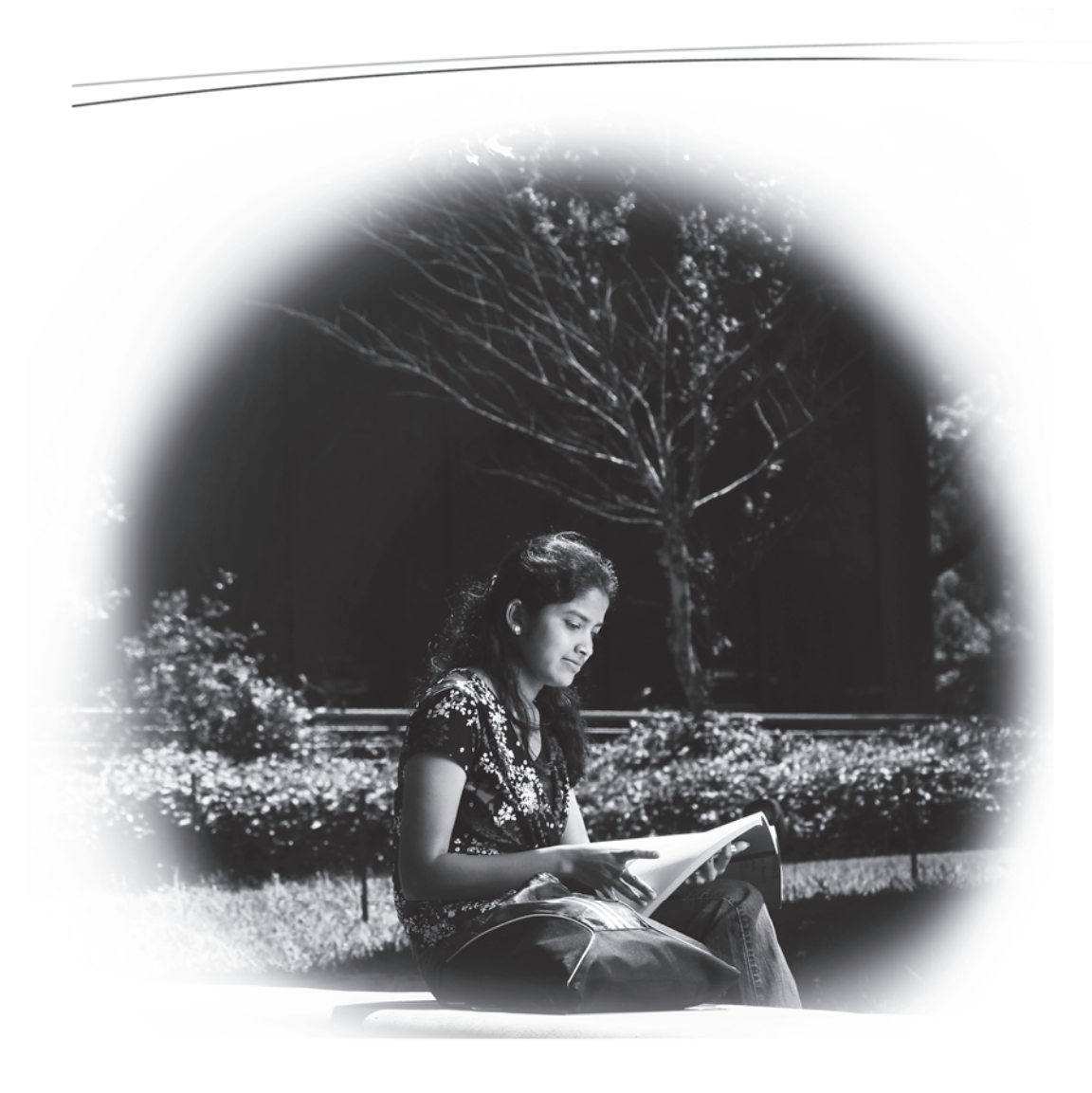
At UHCL, students enjoy the outdoors while studying for their next class. UHCL's beautiful campus offers open spaces for students to relax between classes or just to take a few minutes to commune with nature.