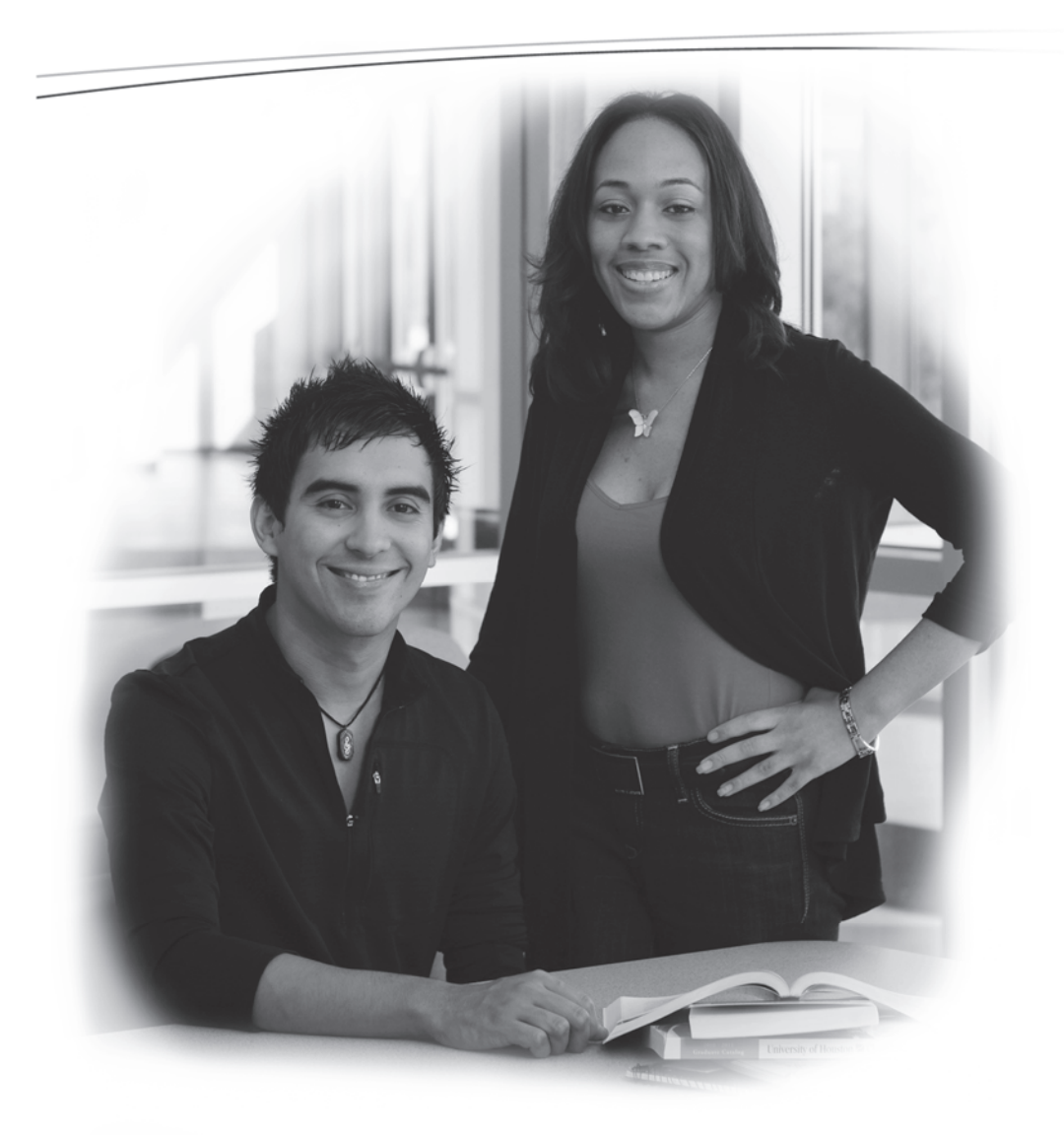
UHCL Pearland Campus opened in fall 2010, offering convenience and opportunity to Pearland-area residents. Students can complete junior, senior and graduate coursework in high-demand disciplines such as business, education and psychology.