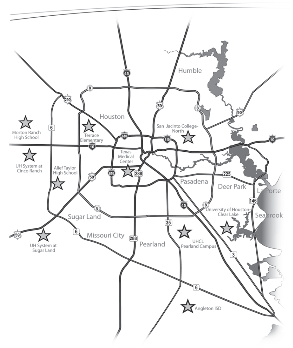
UHCL offers convenient educational opportunities throughout the Houston-Galveston area.