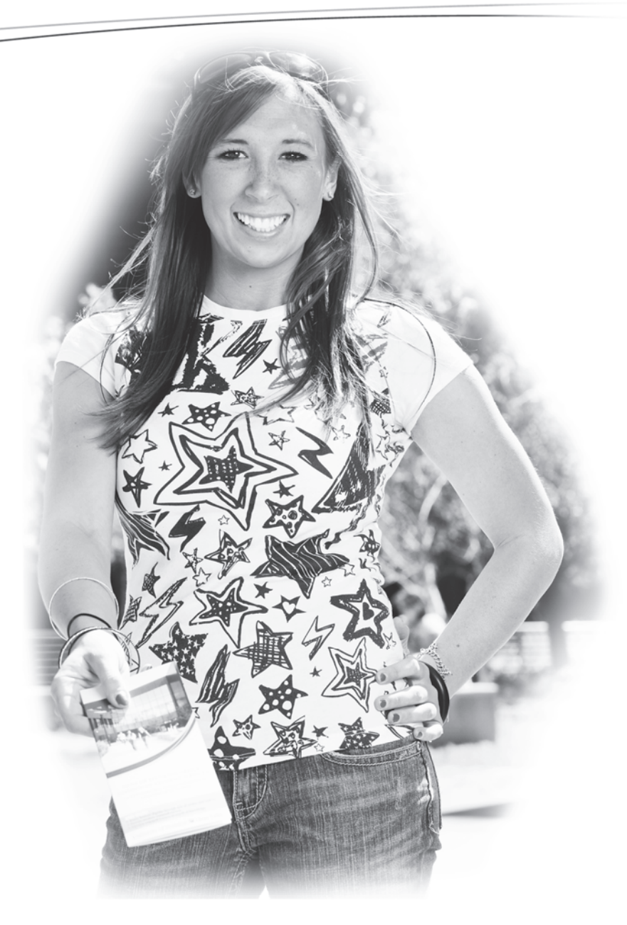
At UHCL, there is a friendly face around every corner. UHCL's Student Assistance Center, housed in the Student Services and Classroom Building, is staffed with friendly, knowledgeable people ready to assist students.