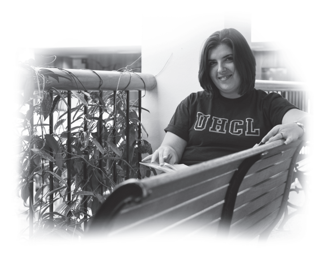
Whether indoors or outdoors, students find the environment at UHCL ideal for individual or group study.