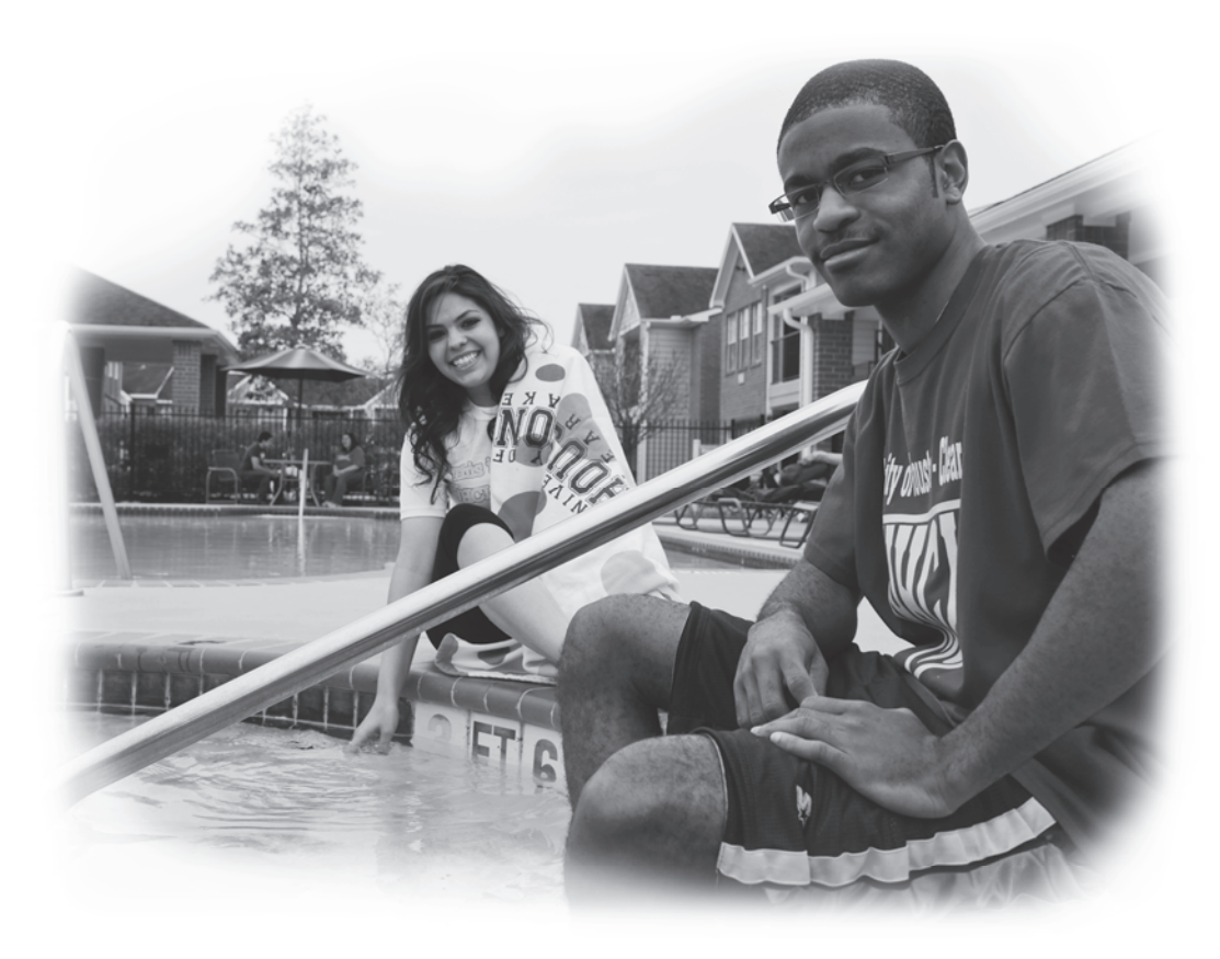
Students relax by the pool and hot tub at University Forest apartments, located on the UHCL campus.