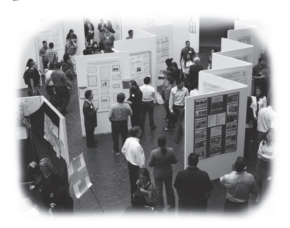
UHCL's annual Student Conference on Research and Creative Arts showcases student research projects in a professional forum, enhances classroom experiences by facilitating interaction across disciplines and strengthens the role of education in the professional community.