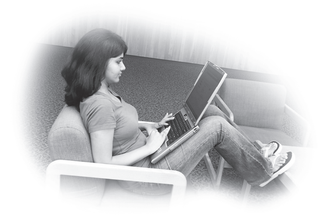
Students applying for financial aid can complete the process entirely online.