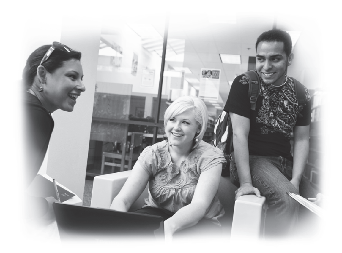
Logging in to E-Services is easy and convenient. Students have the ability to check their financial aid award at any time, even during a quick break during a study session.