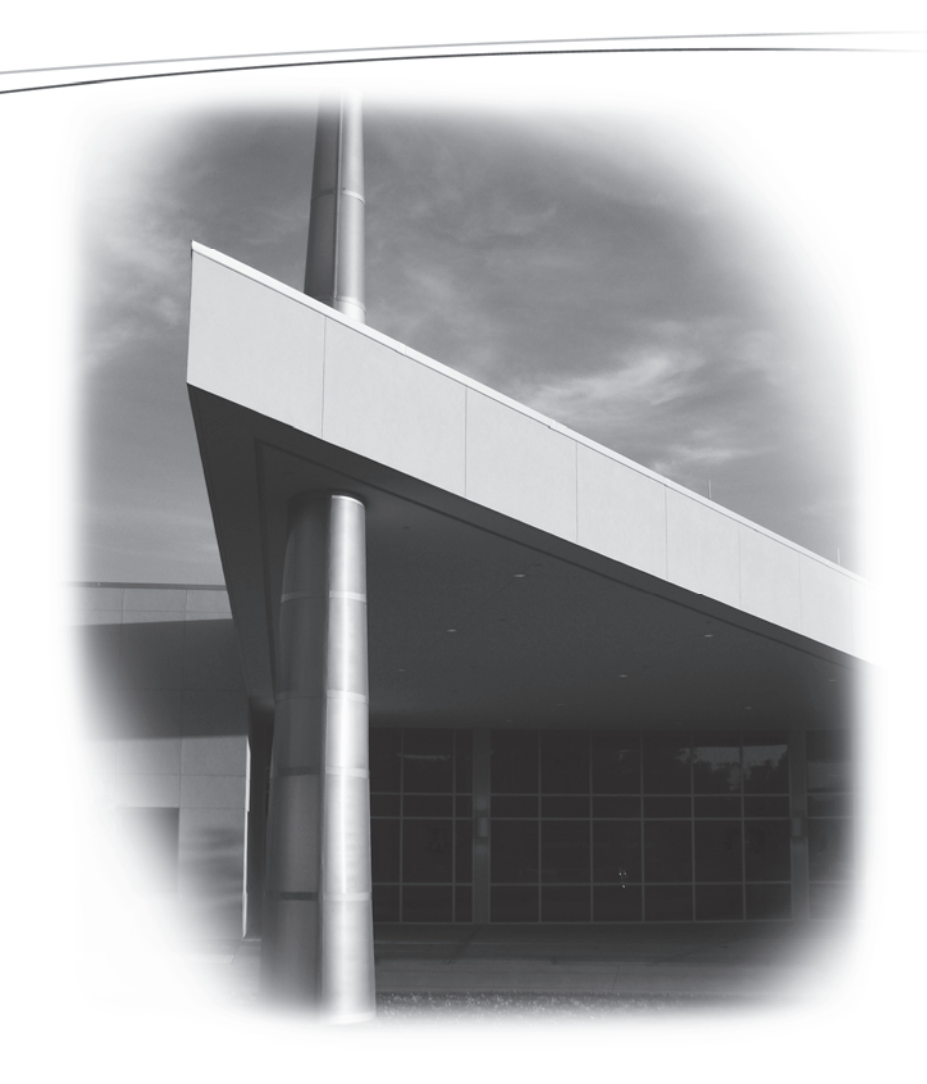
UHCL Pearland Campus opened in fall 2010, offering convenience and opportunity to Pearland-area residents. Students can complete junior, senior and graduate coursework in high-demand disciplines such as business, education and psychology.