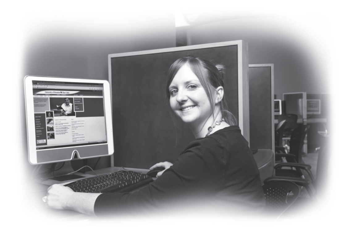
Students can find all the information they need for success at UHCL by visiting www.uhcl.edu.