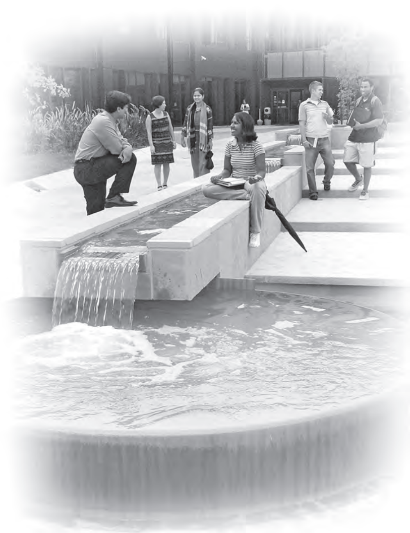
Alumni Plaza, located between the Student Services and Classroom Building and the Bayou Building, is a relaxing place to study and take a break between classes.