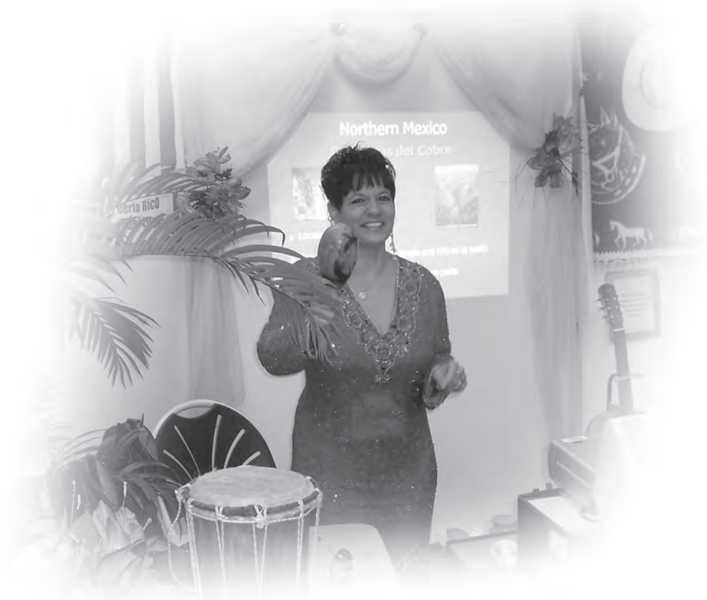
Students celebrate their countries, cultures and traditions at the university's annual Global Expo.