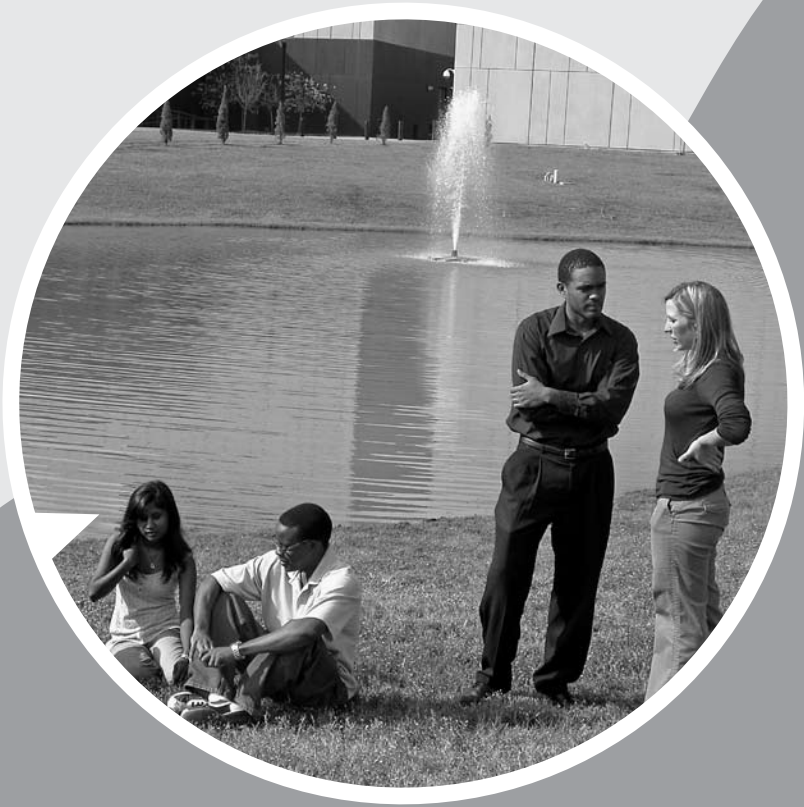
Students enjoy a relaxing time in front of the pond in front of the Student Services and Classroom Building.