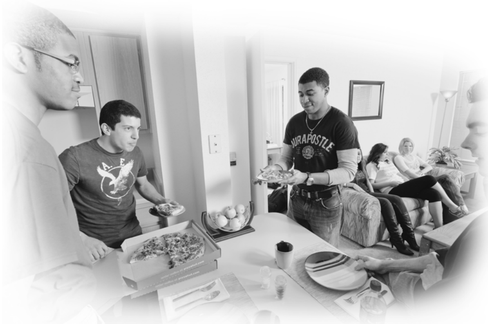
Students enjoy a meal together at University Forest Apartments, located just off campus.