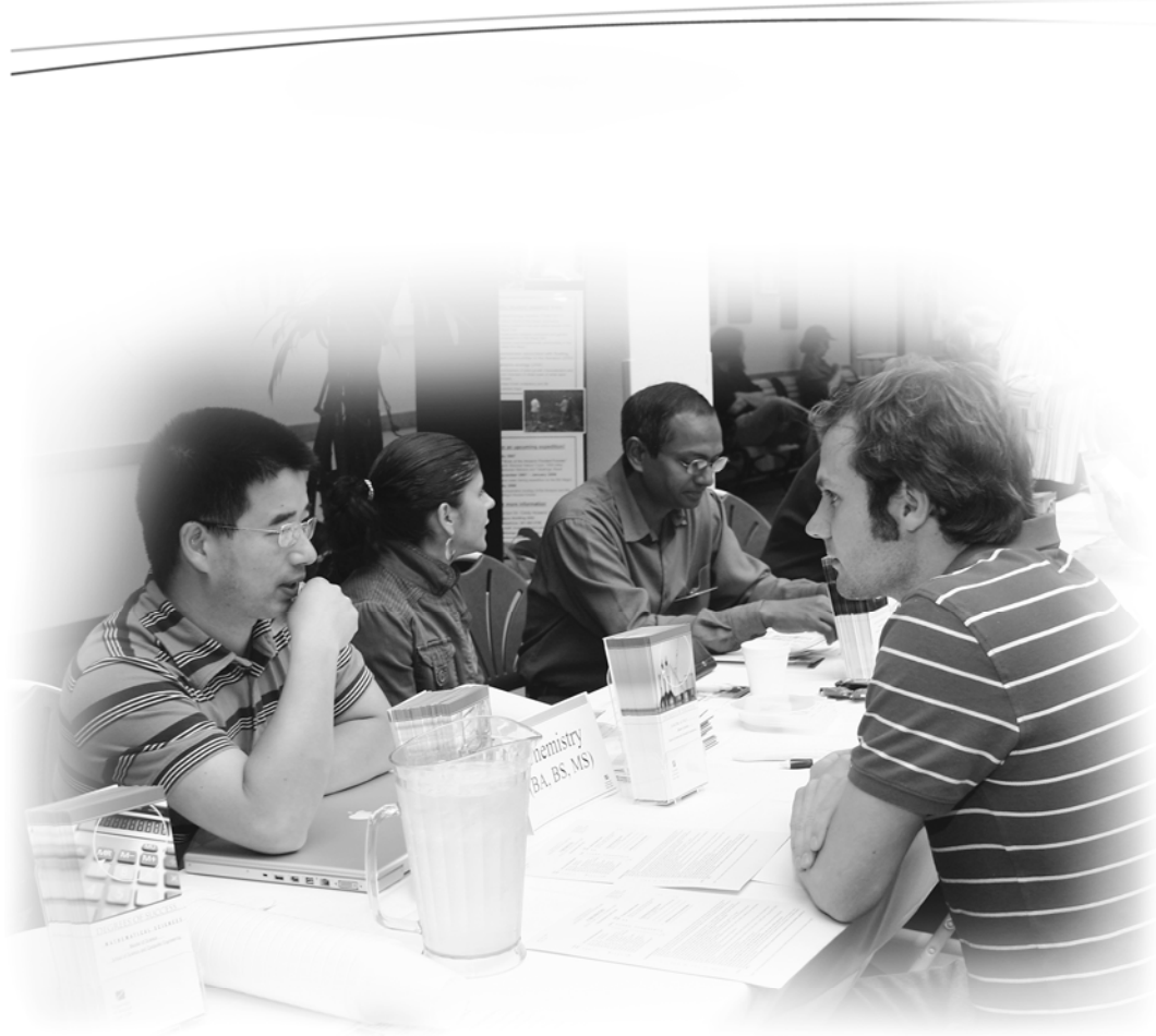
Prospective students discuss Science and Computer Engineering programs at UHCL's Open House event.