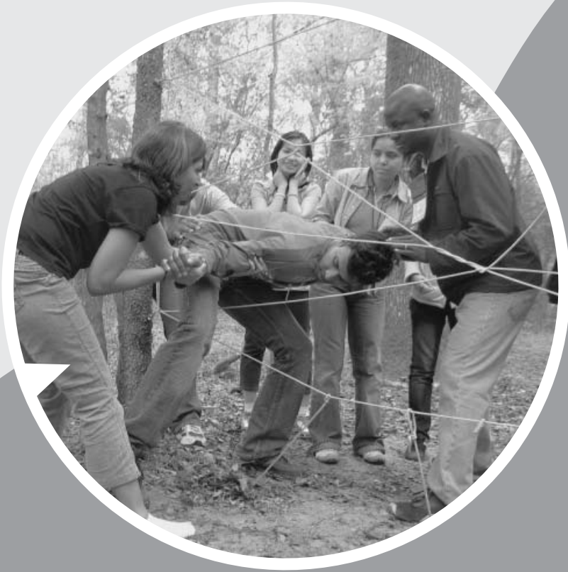
Students negotiate a low ropes course challenge at the annual Student Leadership Institute Retreat.