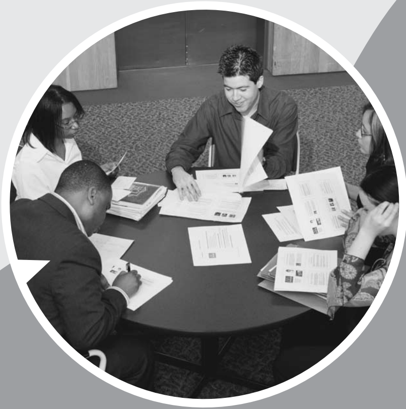
A group of business students gather in the Bayou Building to work on a group project.